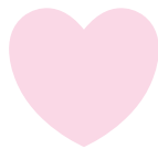
Large Heart Locket